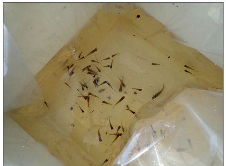
Figure 7. Starhead topminnows in transport cooler for stocking.

Year 2, 2019, began with managing water supply and maintaining adequate dissolved oxygen levels in the pond over the winter. A few water-supply freeze-ups occurred in the shallowly buried pipe between the well's anti-siphon chamber (an air space to prevent back-