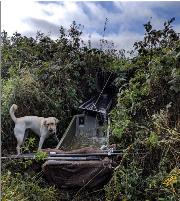
Figure 6. Jury-rigged system set up to catch escaping Starhead Topminnows, with Hatchery Manager Biscuit on duty.

Pond management included daily dissolved oxygen monitoring, aeration when needed, daily well pumping, and aquatic plant