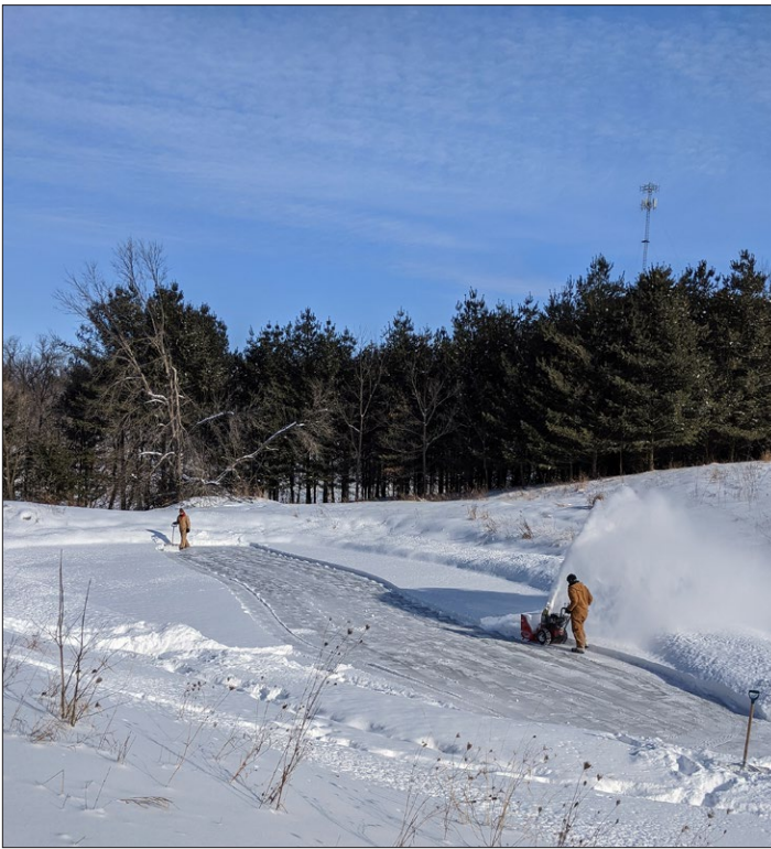
Figure 8. We had to hire for snow removal after heavy snowstorms. This 9-inch snowstorm was way too much work for us senior-citizen biologists.

flow to the well) and pond. The buried pipe was replaced with an overland pipe that can be detached and thawed if ice blocks water flow. Clearing snow off the pond was a priority to ensure light penetration and photosynthetic oxygen production (Figure 8). After one storm dumped 10 inches of snow on the pond, dissolved oxygen declined rapidly to 0.9 mg/l (Figure 3). The heavy snow also placed pressure on the ice. As holes were drilled for aeration, water rushed onto the ice and melted snow. We moved air stones around daily to distribute aeration and allow the open water to quickly freeze and create clear ice. The combination of snow melt and patches of clear ice, as opposed to cloudy white ice, increased light penetration, which then encouraged plant photosynthesis and increased dissolved oxygen (Prowse and Stephenson 1986). We only aerated when low dissolved oxygen threatened because continuous aeration in subzero conditions could quickly cool this shallow pond adding to ice thickness and reduced living space.