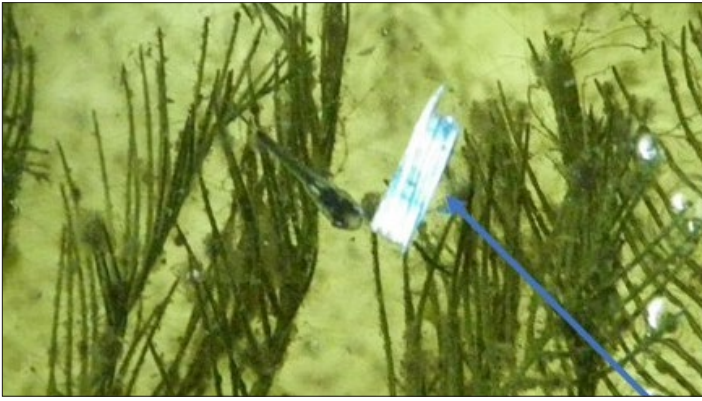
Figure 5. A nearly week old Starhead Topminnow fry next to a 5 mm float for scale.

backswimmers that had been unintentionally collected during the capture process. When confined in the bucket, the backswimmers could easily catch and kill the small Starhead Topminnows. NAN-FA member Charles Nunziata (2017 American Currents 42: 5–9) described the importance of careful and limited handling of Fundulidae species. He mentioned collecting the fish can be traumatic and expose them to infections. Respectful handling of the fish was always our priority, but we also learned to remove backswimmers immediately from the buckets of Starhead Topminnows that were destined to be stocked in the Wisconsin River.