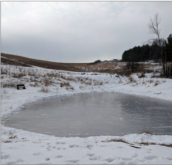
Figure 2. Topminnow Pond January 2021, facing south.

Savanna in Iowa County. This small pond, only 0.1 acre in area with a maximum depth of 6 feet, was constructed as an embankment-excavation pond. Its only water source was infrequent surface runoff from the pond's 22-acre watershed of native grassland. The pond is productive given the relatively large watershed to pond ratio (220:1) but no significant nutrient sources exist. This landlocked pond did not require permits since it was constructed in a low-lying hay field as opposed to a floodplain or wetland. Floating Leaf Pondweeds Potamogeton natans and P. nodosus cover most of the pond surface during the growing season. Other plants include White Waterlily Nymphaea odorata , Spatterdock Nuphar advena and Pickerel Weed Pontederia cordata . Low densities of Muskgrass Chara and the non-native Eurasian Watermilfoil Myriophyllum spicatum grow around the perimeter. The pond supports diverse planktonic and benthic invertebrates, along with American Toads Anaxyrus americanus , Green Frogs Lithobates clamitans , Pickerel Frogs L. palustris , Spring Peepers Pseudacris crucifer , Chorus Frogs P. triseriata , Eastern Gray Treefrogs Hyla versicolor , Cope's Gray Treefrogs ( H. chrysoscelis ), Snapping Turtles Chelydra serpentina , occasional Painted Turtles Chrysemys picta , and Common Water Snakes Nerodia sipedon .