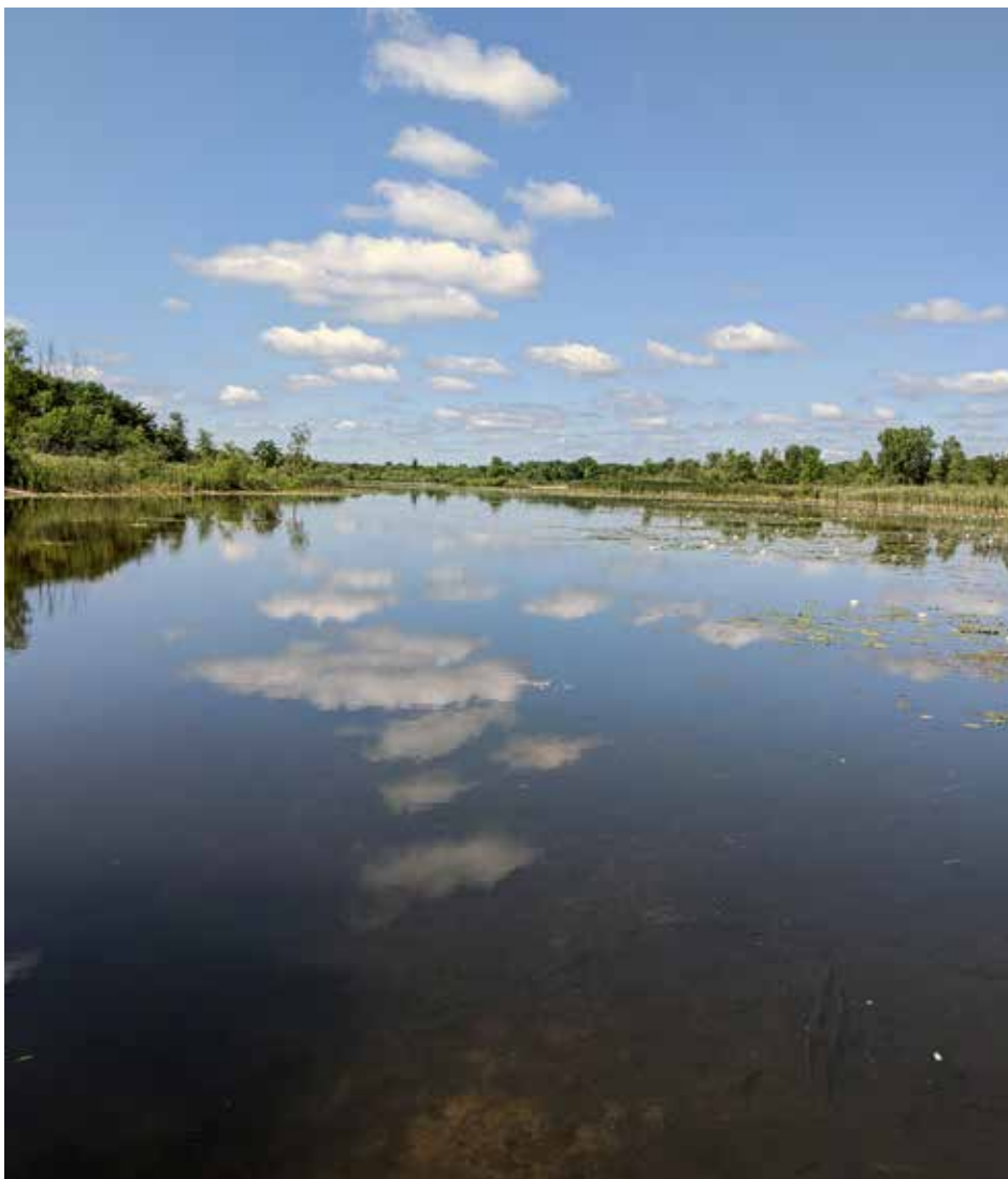
Figure 3. Borrow pit lake looking south demonstrating somewhat linear channel similar to the natural cutoff channel oxbow lakes within the LWSR.

plants (FFP). Dense FFP mats often degrade water quality and habitat and threaten many types of aquatic life. Anoxia beneath extensive FFP mats is a common problem. Under the right conditions, FFP dominance can become an alternative stable state (Scheffer et al. 2003).