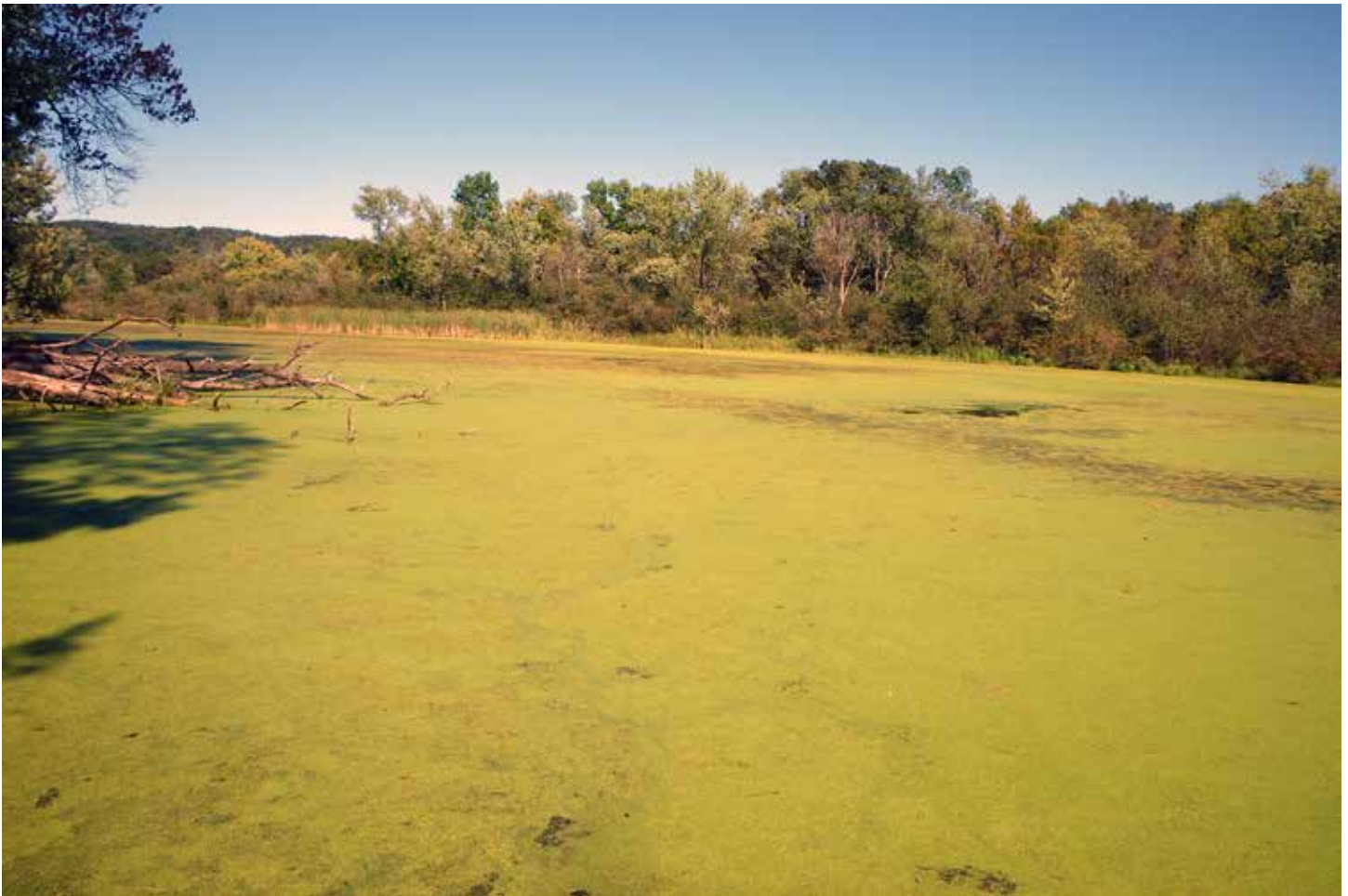
Figure 4. Photo of duckweed growth covering Jones Slough oxbow.

FFP dominance occurred. The borrow pit is also a seepage lake with groundwater as the primary water source. Our team (Figure 5) split study responsibilities focusing on aquatic plants, monthly water quality sampling and fish surveys.