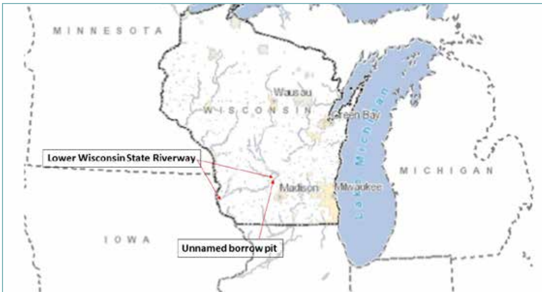
Figure 2. Overview map showing location of Lower Wisconsin State Riverway and borrow pit