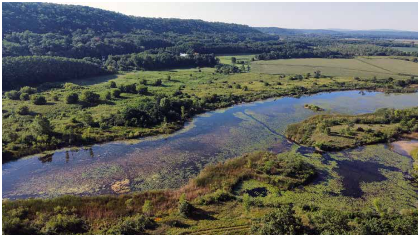
Figure 1. Drone photograph of the borrow pit lake with clean groundwater recharge area known as Blackhawk Ridge in the background.

The oxbow lake eutrophication came in the form of dense mats of duckweeds and filamentous algae (Figure 4), collectively described as free-floating